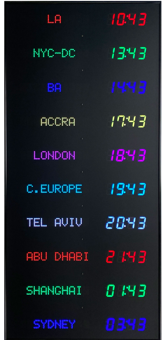
Model 3420I - 1.8" time, 1.2" zone labels, 10 zones